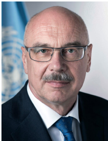
Mr. Vladimir Voronkov Under-Secretary-General for Counter-Terrorism