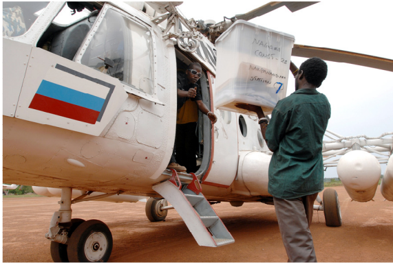
Ballots and voting materials are loaded onto a helicopter provided by the United Nations Mission in the Sudan (UNMIS). Delivery of election materials to remote areas was one way in which UNMIS provided technical and logistical support to Sudan's National Elections Commission in April 2010.

The United Nations also has established relations with governmental, intergovernmental and non-governmental organizations involved in electoral assistance, including the European Union, the Organization of American States, the Organization for Security and Cooperation in Europe, the African Union, International IDEA, the Carter Center and the International Foundation for Electoral Systems. These relationships provide opportunities for collaboration on electoral support activities as well as for sharing lessons and experiences.