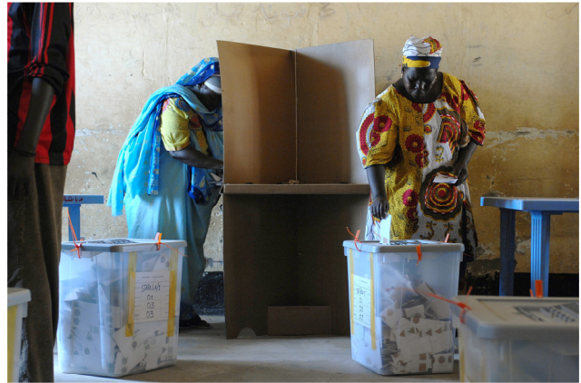
Women in Juba, Sudan, vote in their country's national elections, the first to take place in almost 25 years.

The values of freedom, respect for human rights and the principle of holding periodic and genuine elections by universal suffrage are essential elements of democracy. In turn, democracy provides the natural environment for the protection and effective realization of human rights. These values are embodied in the Universal Declaration of Human Rights and further developed in the International Covenant on Civil and Political Rights, which enshrines a host of political rights and civil liberties underpinning meaningful democracies.