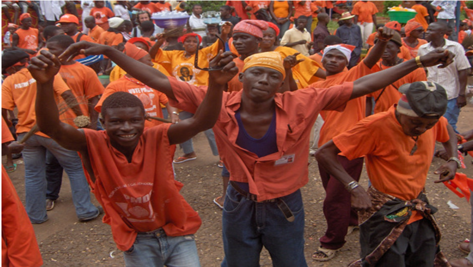
An UNDEF-supported initiative for human rights and freedom of expression in Sierra Leone.

The Fund provides grants of up to $500,000. In four rounds of funding so far, UNDEF has supported more than 330 projects in 115 countries.