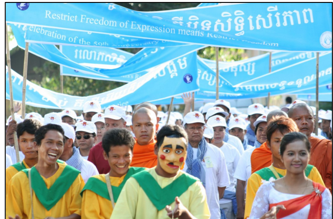
Marchers in Wat Phnom, Cambodia, highlighting freedom of expression.