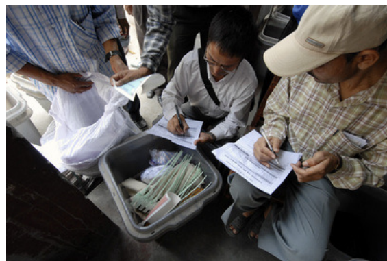
Electoral officers from the United Nations Mission in Nepal prepare ballot boxes and other polling materials for distribution throughout the country.