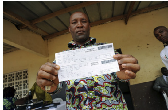
A citizen from Côte d'Ivoire displays his election registration.

The provision of electoral assistance by the United Nations is a team effort involving a number of agencies and departments and is closely regulated by the General Assembly. Electoral assistance is based on the principle established in the Universal Declaration of Human Rights that the will of the people, as expressed through periodic and genuine elections, shall be the basis of government authority, while also recognizing the principles of state sovereignty and national ownership of elections. To ensure compliance with these principles, the Under-Secretary-General for Political Affairs serves as the UN Focal Point for Electoral Assistance Activities, advising the Secretary-General on electoral matters.