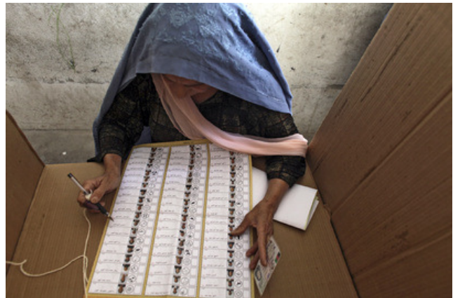
An Afghan woman exercises her right to vote in the Presidential and Provincial Council Elections.

The Universal Declaration of Human Rights, adopted by the General Assembly in 1948, clearly projected the concept of democracy by stating “the will of the people shall be the basis of the authority of government.” ii The Declaration spells out the rights that are essential for effective political participation. Since its adoption, the Declaration has inspired constitution-making around the world and has contributed greatly to the global acceptance of democracy as a universal value. iii