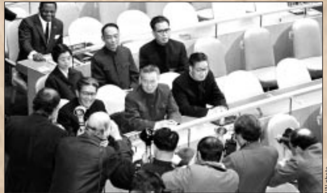
China takes seat in the General Assembly, November 1971.

International Convention on the Elimination of All Forms of Racial Discrimination comes into force.