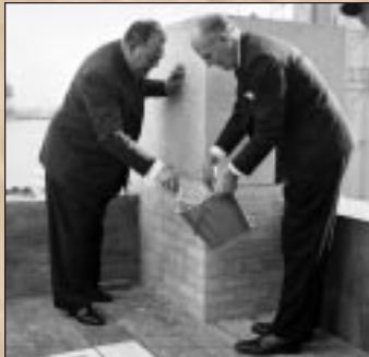
Laying the cornerstone for UN Headquarters

UN envoy Ralph Bunche secures ceasefire between the new State of Israel and Arab States.