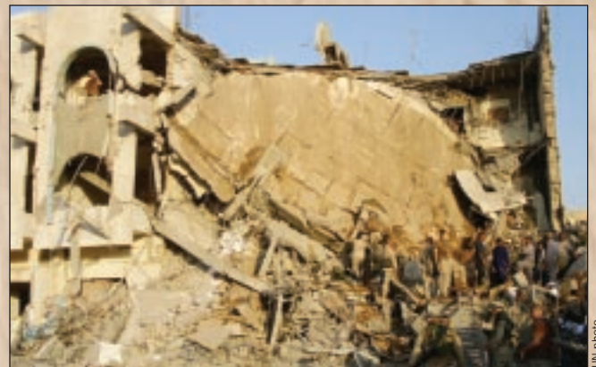
The UN building after the bombing

Terrorist attack on UN headquarters in Baghdad results in 22 deaths, including the head of mission, Sergio Vieira de Mello. Many others are seriously wounded.