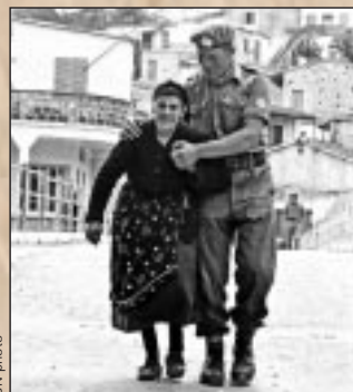
A peacekeeping soldier escorts an elderly Greek woman across the bridge from the Turkish to the Greek sector in Cyprus.

Ralph Bunche becomes the first United Nations Nobel Peace Laureate.