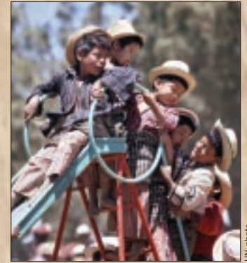
Children around the world are protected by the 1990 Convention.

Convention on the Rights of the Child comes into force. The World Summit for Children convened on 29 September is attended by 71 Heads of State and Government.