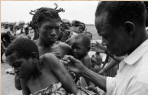
Vaccination for smallpox became a thing of the past in 1980.

Three years after the last case was reported, World Health Organization (WHO) officially declares smallpox eradicated.