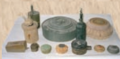
Variety of landmines

Convention on the Prohibition of the Use, Stockpiling, Production and Transfer of Anti-Personnel Mines and on Their Destruction (Mine Ban Convention), which was opened for signature in Ottawa, Canada in December 1997, enters into force.