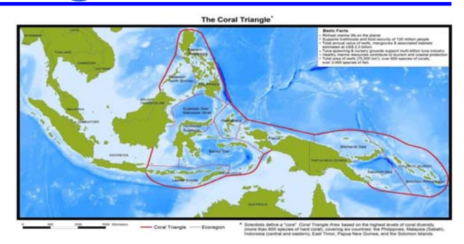
Coral Triangle covering the Philippines, Malaysia (Sabah), Indonesia (central and eastern), East Timor, Papua New Guinea and Solomon Islands

assessment, monitoring and information management, sustainable financing, capacity building, public/private partnerships, and enabling relevant laws and policies. This program geographically involves six states: Indonesia, Malaysia, the Philippines, East Timor, Papua New Guinea, and Solomon Islands.