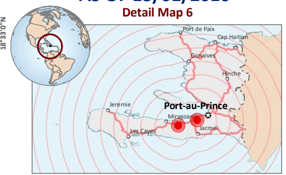
Detail Map 6